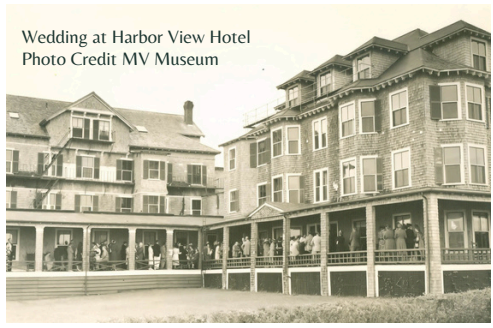
Wedding at Harbor View Hotel